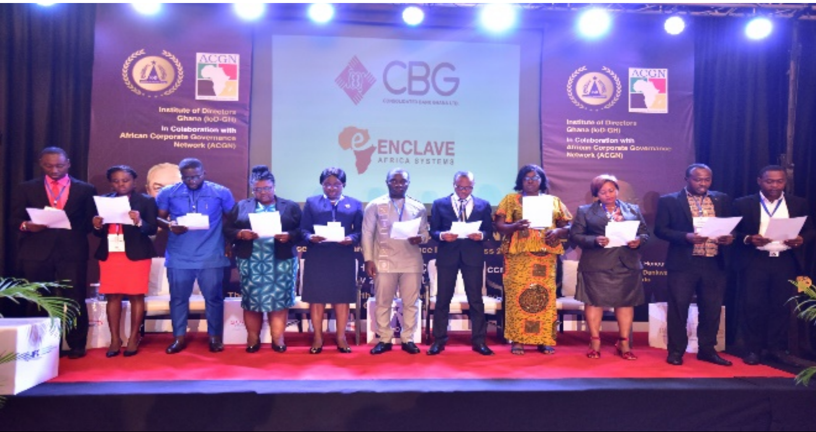
photograph of inductees