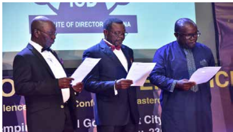
Induction of fellows ng inducted