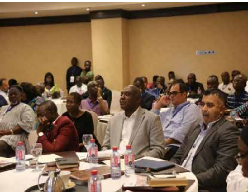
Seated attendants during the Masterclass