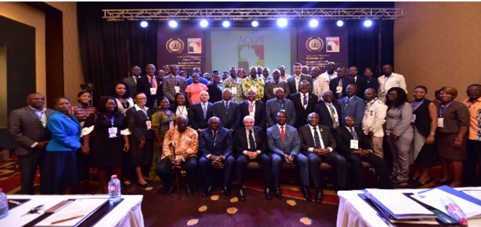
A group photograph of conference attendees