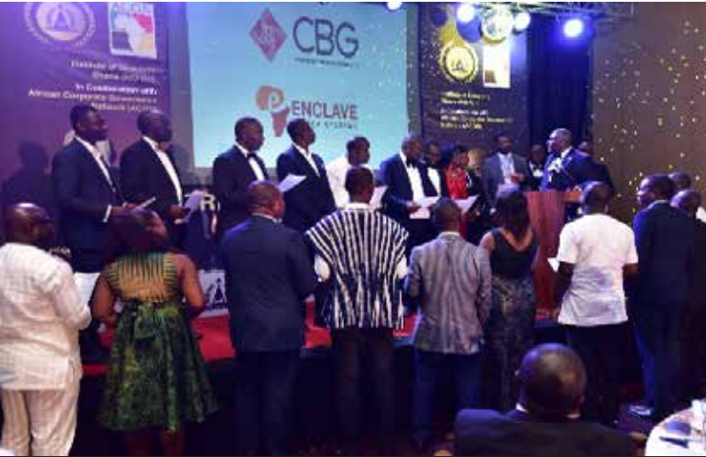
A photograph of members being inducted