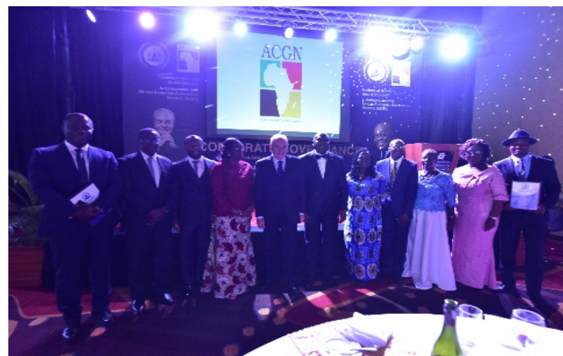
A group photograph of Council Members after the Awards/Dinner