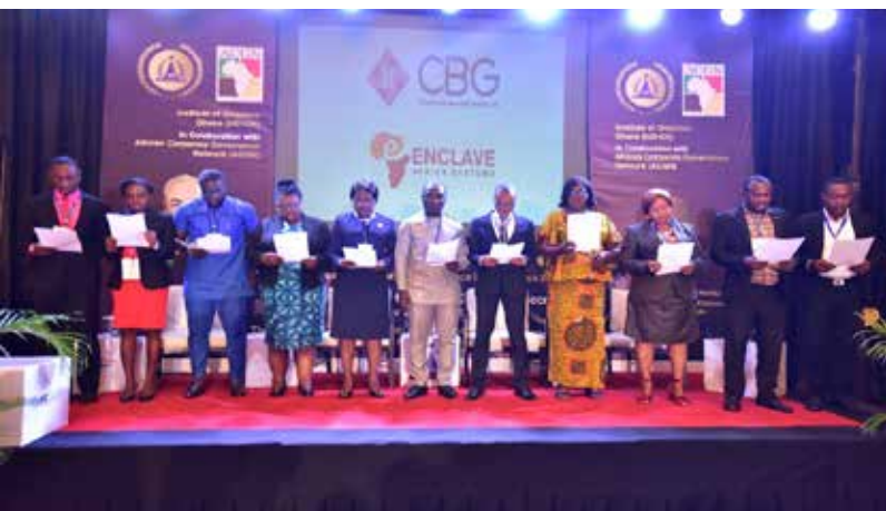
Members inducted during the awards dinner;