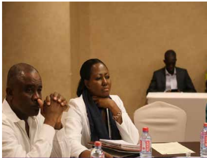
Seated attendants during the Masterclass