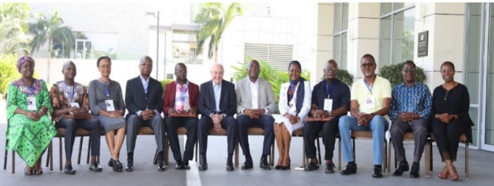
A group photograph of council members after the masterclass