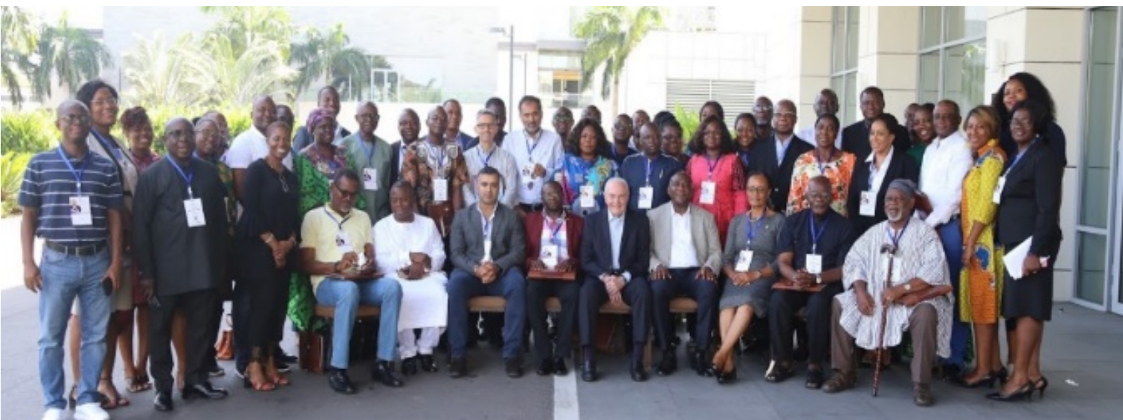
Group photograph of masterclass participants